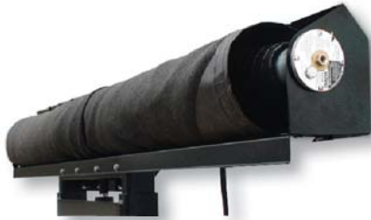
Easy Ratchet Spring Tension Adjustment

The Tower System is also available with the ultra reliable semi-automatic Pulltarp System. With the Tower fully raised, the tarp is pulled out to cover the load and secured to the back of the bin. The Tower is then lowered pulling the tarp down over the front of the bin. The heavy duty 12 gauge steel Wind Guard Housing comes complete with our external spring adjustment and has a lifetime guarantee* on the roller spring.