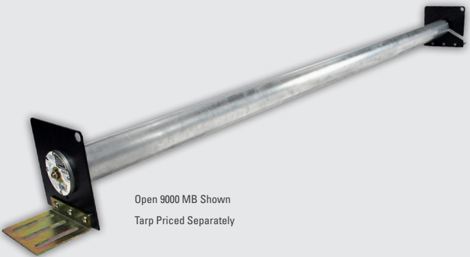
Open 9000 MB Shown Tarp Priced Separately

Open Housing with Ratchet or Electric Motor