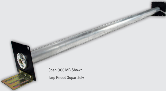
Open 9000 MB Shown Tarp Priced Separately