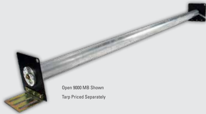
Open 9000 MB Shown Tarp Priced Separately