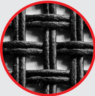
18oz. Super HD Mesh

Open weave heavy duty mesh provides protection for hauling junk and landscaping debris.