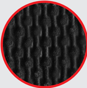
18oz. Waterproof Vinyl

Double-weave is less permeable and ideal for hauling sand, gravel, and debris.