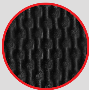
18oz. Waterproof Vinyl

Double-weave is less permeable and ideal for hauling sand, gravel, and debris.